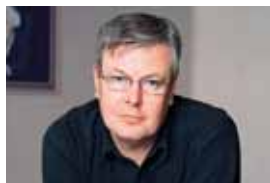
Petr Altrichter Conductor