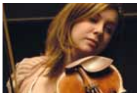
Mozart The Marriage of Figaro Overture (4*)